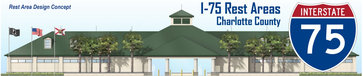
Rest Area Design Concept